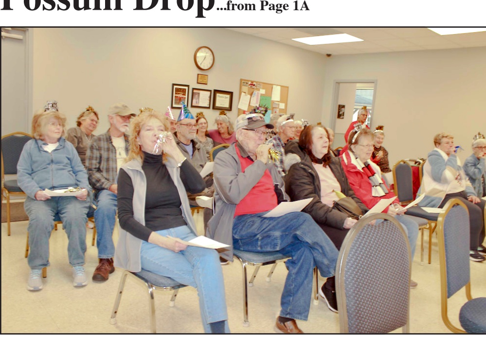
Local senior citizens had a blast during the recent New Year's celebration, held every year at the Senior Center.