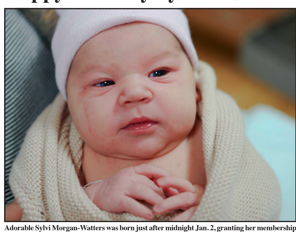
in the exclusive club of first babies born locally each new year.